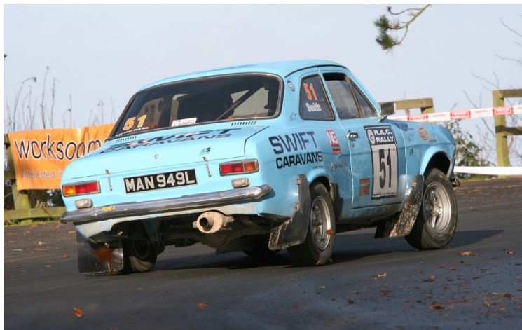
..... and also took fourth in Class on the 2009 Roger Albert Clark Rally